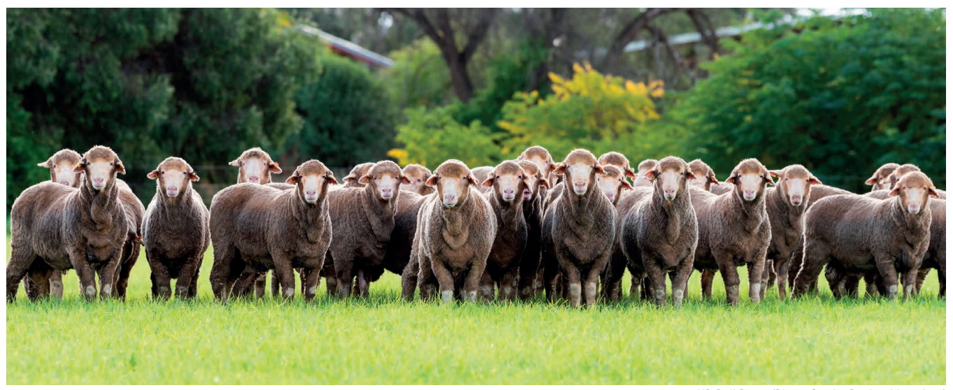
HR Poll Rams

There was quality, measured flock sires for all budgets and will be again this year. The auction team look like sires already! All our Polls have ASBV information plus pedigrees and actual data displayed for our clients to make the best possible purchasing decisions. We have been steadily building our pure Poll ewe numbers to meet the increasing demand from our clients. We have now reached 2500 stud ewes of which we artificially joined 1800 to industry leading sires.