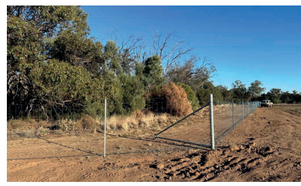
Newly rebuilt catching pens